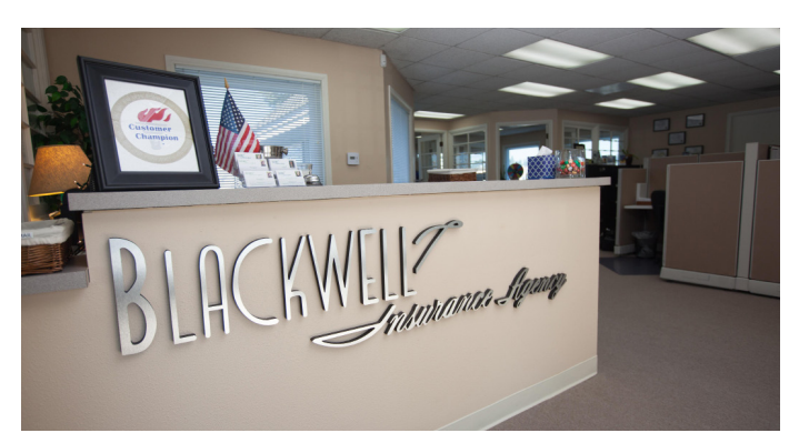
SOUTH ORANGE COUNTY 23002 Lake Center Dr, Suite 200 Lake Forest CA 92630